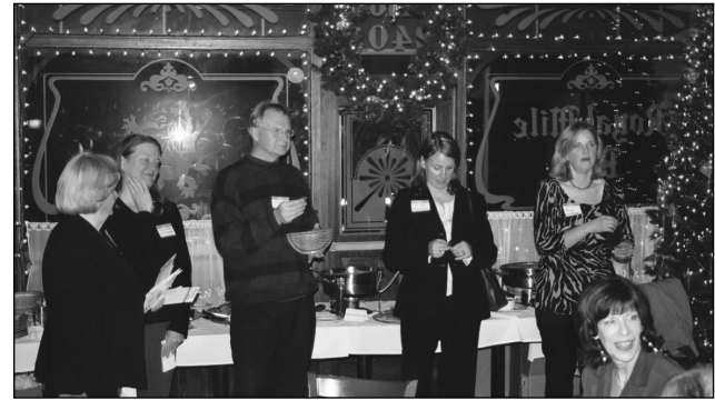
December Mixer