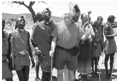
Details on Page 3